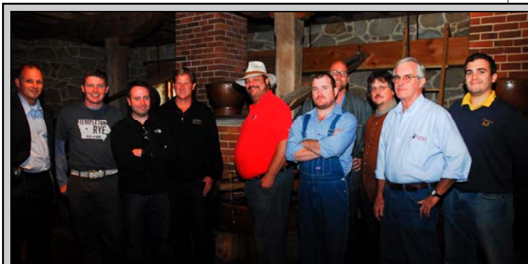
Craft Distillers Recreate President George Washington's Peach Brandy at Historic Mount Vernon, Virginia

Several distillers stayed as guests at Mount Vernon.