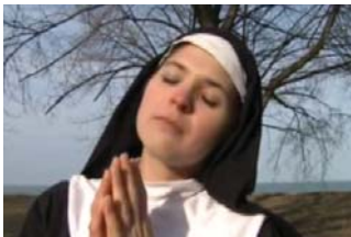
"The Former Nun"

As an overall point, the complainant states that the “video advertisements, due to their content and subject nature, do not reflect generally accepted contemporary standards of good taste; degrade the image, form, or status of women, ethnic, minority, sexually-oriented, or religious groups; contain lewd or indecent images or language; employ religion or religious themes and rely upon sexual prowess or sexual success as a selling point. These advertisements are a representative sample of hundreds of videos which contain potential violations.” The complainant asserts that these videos are inconsistent with Responsible Content Provision Nos. 23, 24, 26, and 27 of the DISCUS Code.