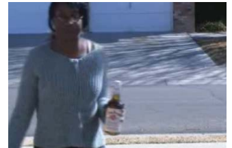
"Through a Man's Eyes"