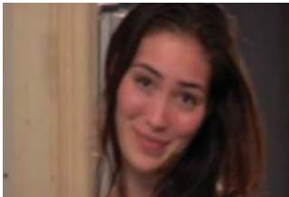
"A Beautiful Tragedy"