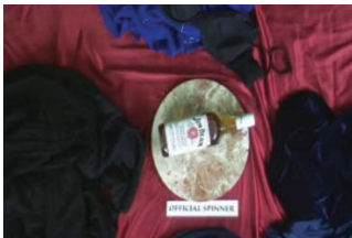
"Spin the Jim"